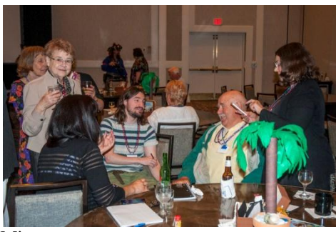
Minnesota poetry crew