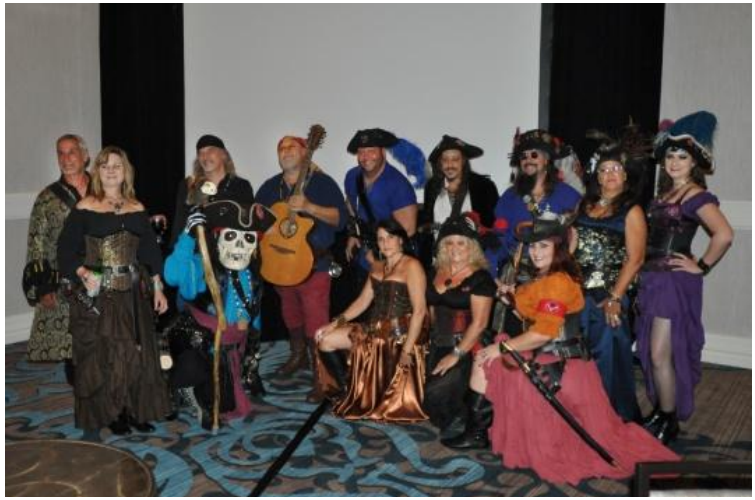
Blackbeard's Pirate Krewe in full and fearsome finery.